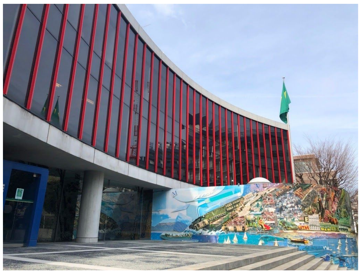
The Embassy of Brazil in Tokyo

ArtSticker Brazil is part of the continued commitment of the Embassy of Brazil and ArtSticker to the Olympic bridge From Rio to Tokyo .